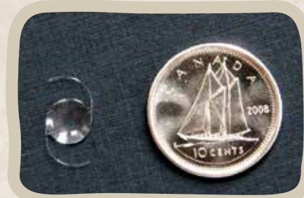
AN INTRAOCULAR LENS IMPLANT (IOL)

In the late 1980s, Aravind was struggling to deliver on its mission of providing equitable eye care to the rich and poor. The affluent were able to afford the then-modern cataract surgical technique with an intraocular lens (IOL) implant which resulted in a far superior visual outcome. However, the