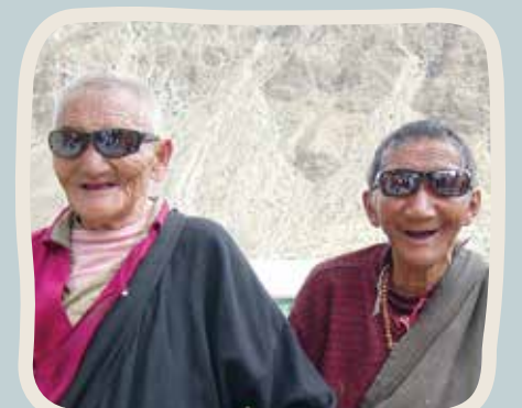
HAPPY SISTERS AFTER SIGHT-RESTORING CATARACT SURGERY

Thanks to you, a total of 1074 people had their sight restored, surpassing our goal of curing the blindness of 1000 people!