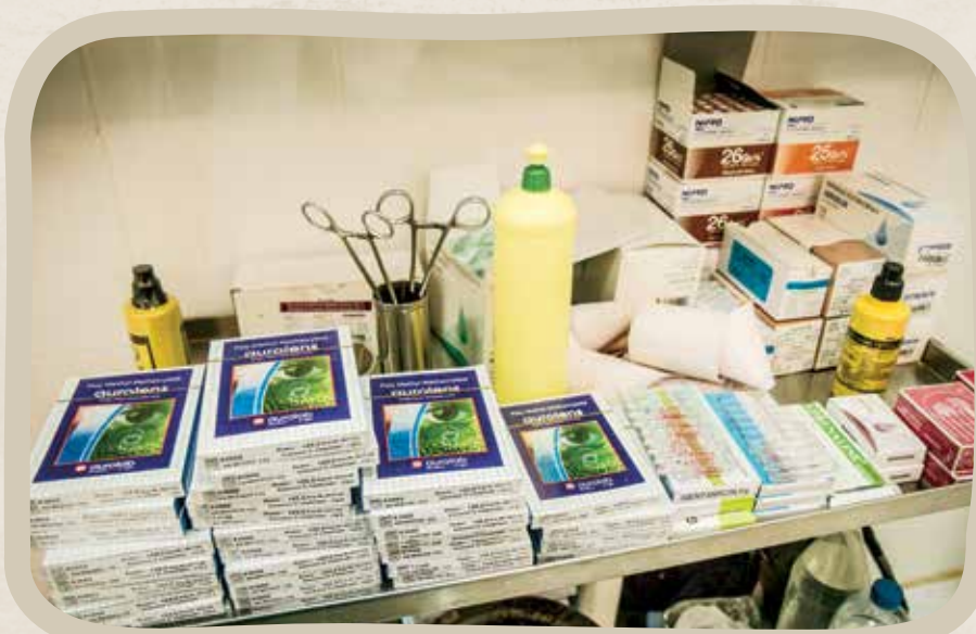
AUROLAB'S IOLS IN ACTION

Aurolab is now a leading manufacturer of intraocular lenses, sutures and other vital supplies for eye care; their products are exported to 120 countries around the world and account for a total of 7.8% of the global share of intraocular lenses.