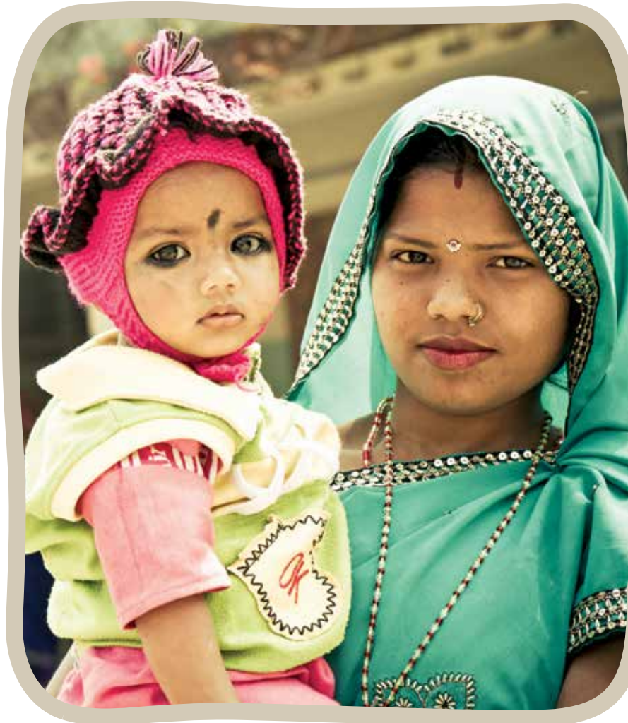
NEPALI MOTHER AND DAUGHTER

Seva Nepal is an excellent example of this work in action, as Nepali women are going blind more often than men, but