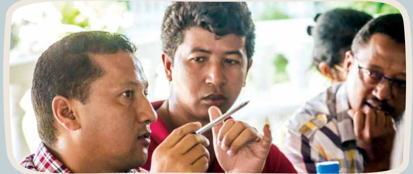
MALAGASY PARTNERS AT A TRAINING MEETING WITH KCCO AND SEVA CANADA