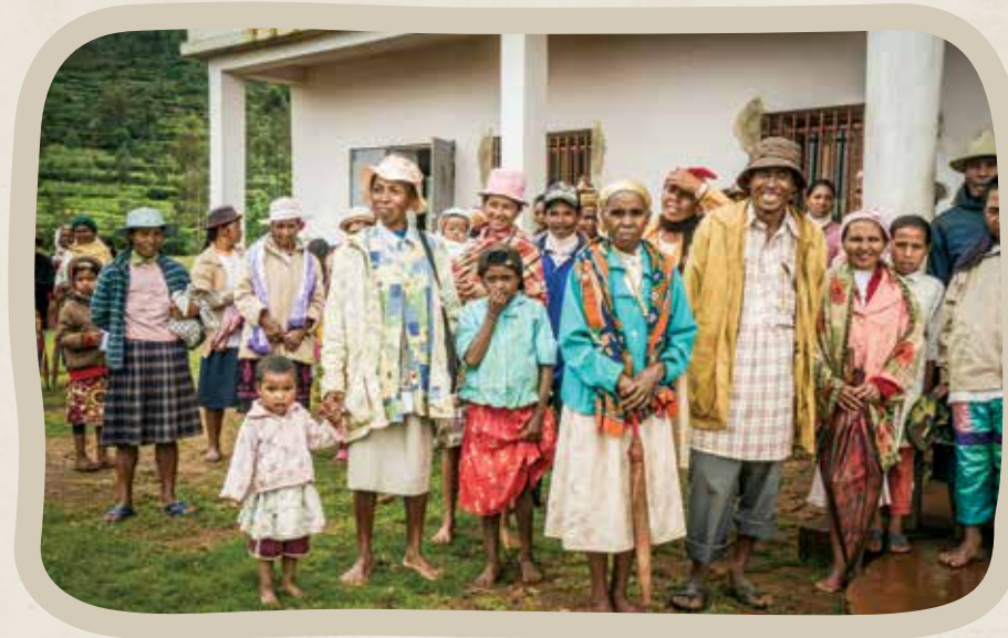
MANDROSOHASINA SCREENING CAMP