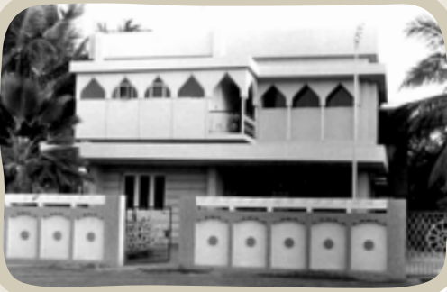
ORIGINAL ARAVIND EYE HOSPITAL

With your generosity and belief that everyone deserves the right to sight, 4 million of the world's most vulnerable people – women, children, and people living in extreme poverty and isolation – have received life-changing cataract surgery and millions more have received eye care services including glasses and medicine.