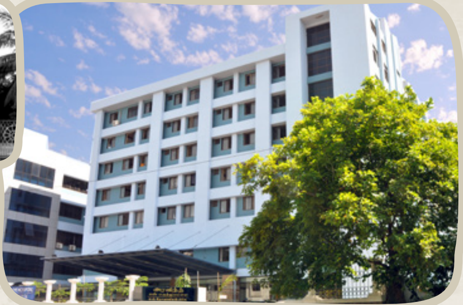
ONE OF THE 6 BUILDINGS THAT COMPRISE ARAVIND IN MADURAI TODAY