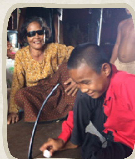
CATARACT PATIENTS BACK HOME AFTER SURGERY

There was no time to spare. Everyone who needed care was treated. By the end of the week, 336 surgeries were completed. The steadfast, exemplary work of the field workers, nurses and the doctors was very inspiring and uplifting. Everything was so understated yet extraordinary and profound.