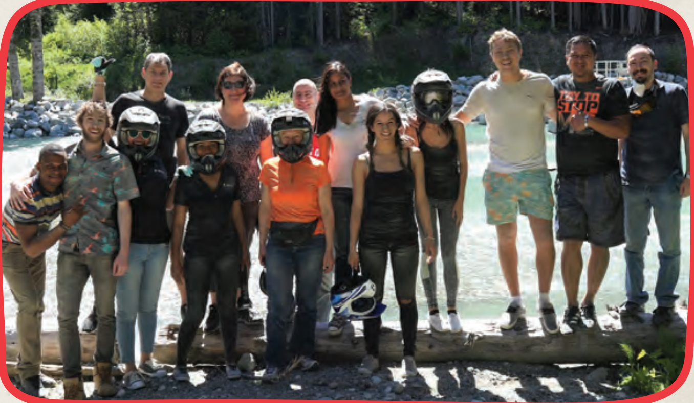
SIPCO STAFF AFTER AN ATV TEAM BUILDING EVENT IN WHISTLER

SIPCO is a proud family-owned company whose mission is to lead change by creating enzyme and other innovative solutions for a healthier planet. They are also a new corporate supporter of Seva Canada's!