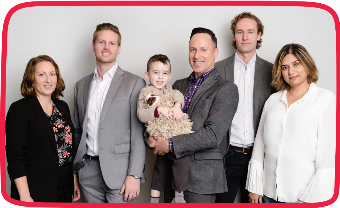
THE WESTERN PINE REALTY TEAM

"To restore someone's sight seems to be as close as you can get to a true miracle!"