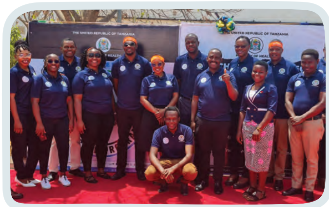
KILIMANJARO CENTRE FOR COMMUNITY OPHTHALMOLOGY TEAM