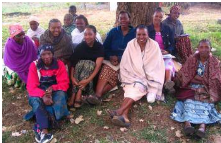
Sentinels in Tanzania—women trained in identifying and counselling those who need eye care.

There is increasing recognition of the astonishing fact that approximately two-thirds of the blind worldwide are women. In Africa an important reason for this inequity is that women and girls are less likely to have access to eye care services than men and boys for a variety of reasons including limited education, decision-making capacity, and access to finances within the household. Women talking to other women at the grass roots level, the peer-to-peer approach, have proven to be an effective way to improve access to services.