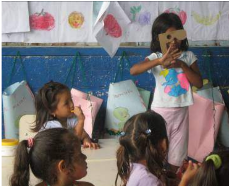
School children in Guatemala receiving free eye testing as part of Visualiza's Little Windows of Light program.